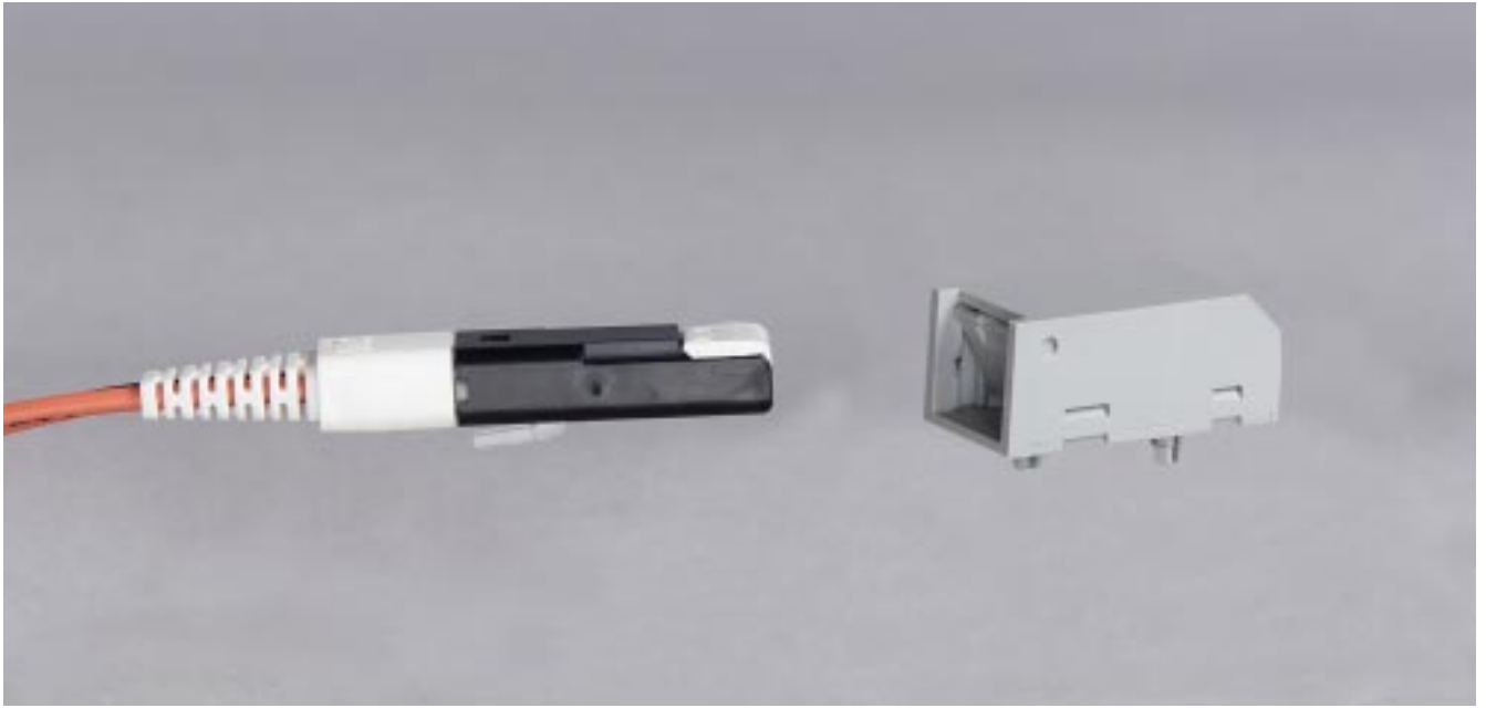
VF-45™ Duplex Fiber Optic Interconnect with transceiver