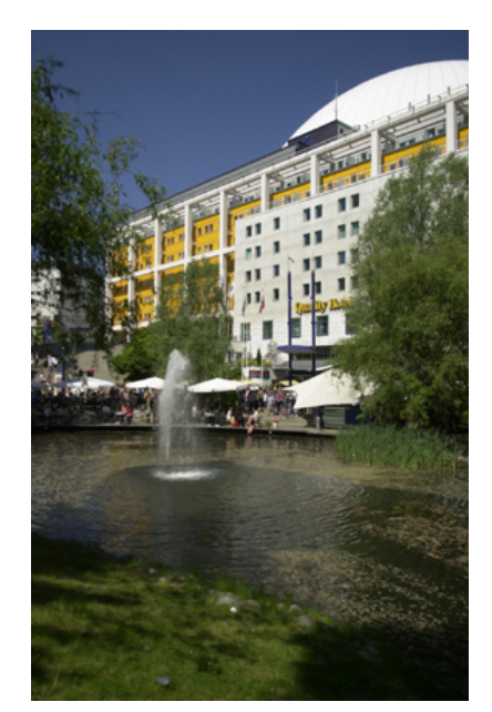
Globe Hotel seen from the park

Quality Hotel Globe is just 8 minutes by metro from the Old Town, the Royal Castle and Stockholm City. Quality Hotel Globe is also within walking distance of Södermalm, one of the trendiest parts of Stockholm with a wealth of cafés, bars and shops.