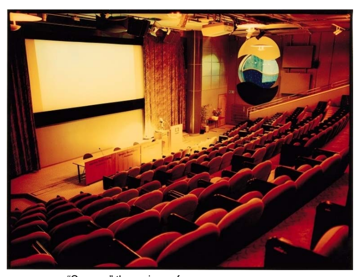
"Cosmos" the main conference room