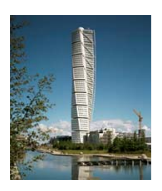
Welcome to Malmö – The city of Sweden

Malmö is the commercial centre of southern Sweden and an international city with 270.000 residents.