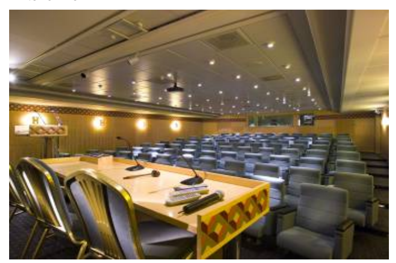
Main conference room