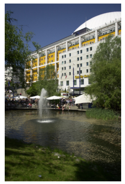
Globe Hotel seen from the park

Quality Hotel Globe is just 8 minutes by metro from the Old Town, the Royal Castle and Stockholm City. Quality Hotel Globe is also within walking distance of Södermalm, one of the trendiest parts of Stockholm with a wealth of cafés, bars and shops.