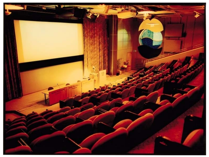
"Cosmos" the main conference room