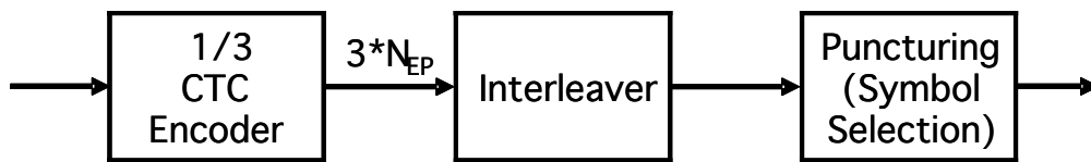
Figure 258—Block diagram of subpacket generation

[Replace the figure 258 on pp. 603 in 8.4.9.2.3.4 with the following one]