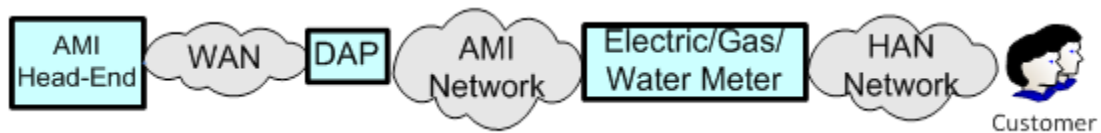
Figure 2: High level example of an AMI system

For more information, refer to NISTIR 7761 V2 (2013) [2].