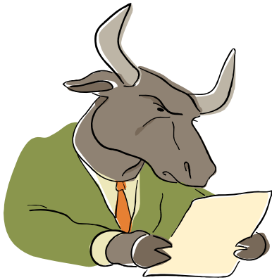
Broad Market Potential