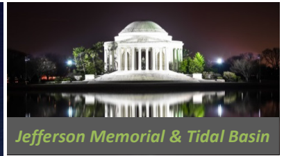
Jefferson Memorial & Tidal Basin