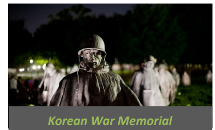
Korean War Memorial

Attendance will be limited... Advance registration is required NO LATER THAN Monday, October 13, 2014.