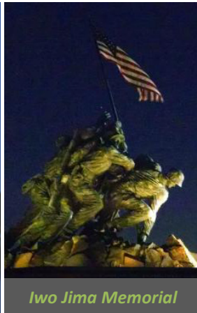
Iwo Jima Memorial