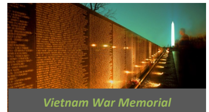
Vietnam War Memorial

Guests will circle the inspiring Iwo Jima Memorial and then make a stop at the Lincoln Memorial to explore the tribute to President Abraham Lincoln and enjoy the stunning views down the National Mall and Potomac River. A short walk from the Lincoln Monument are the Vietnam and Korean War Memorials — both moving tributes to our countrymen who served in these conflicts and stunning to see cast in an amber glow at night.