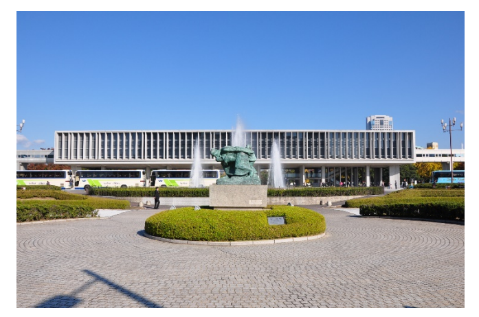
Hiroshima Peace Memorial Museum