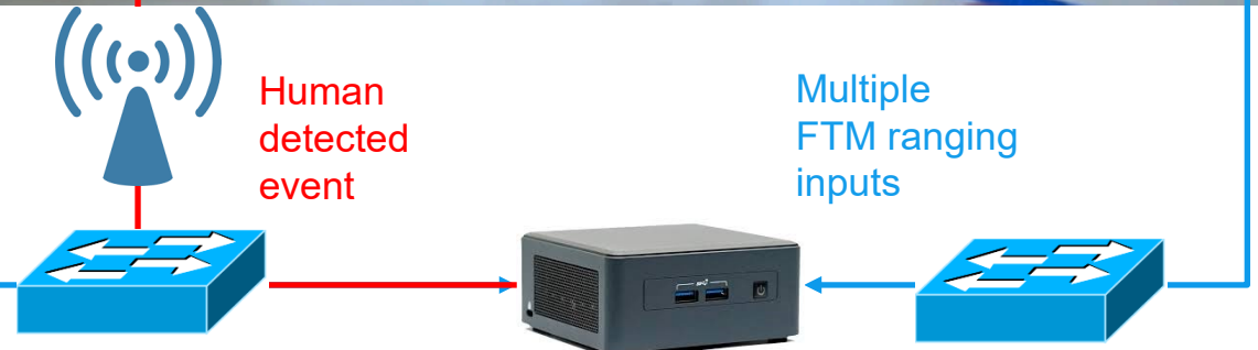
Wi-Fi Location Fusion engine