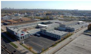
ABB St. Louis

Please join us in touring H-J’s two facilities located just outside of St. Louis. Spread out through 150,000 sq. ft. it includes a foundry, epoxy molding line, test labs, and highly automated machining and assembly areas. This is H-J’s primary manufacturing site producing connectors, bushing assemblies, accessories, and components for transformer, switchgear, and breaker OEMs. This location also serves as the distribution point for all of H-J’s International business as well as its global headquarters. Dinner will be served and transportation will be provided. *Space is limited