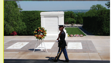
Tomb of the Unknown Soldier