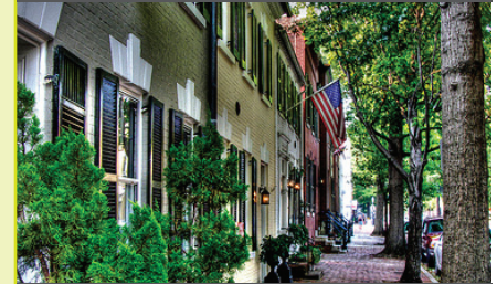
Old Town Alexandria