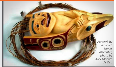
Artwork by Veronica Danes Waechter

Experience an enchanting group dinner at Grouse Mountain, the peak of Vancouver. After a short gondola ride, explore the cozy yet modern chalet fit with all the amenities (and a gift shop!), surrounded by a winter wonderland. With panoramic views of the city lights below and snow-capped mountains all around, savor a delicious meal while embracing the magic of the mountain.