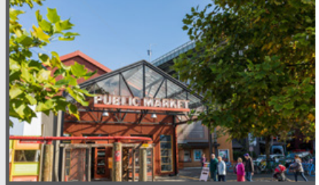
Granville Island Market Tasting