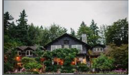
Photography Lesson in Stanley Park