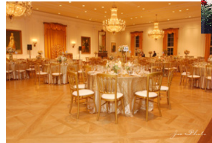
Enjoy sumptuous dining in the stunning replica of the White House's East Room