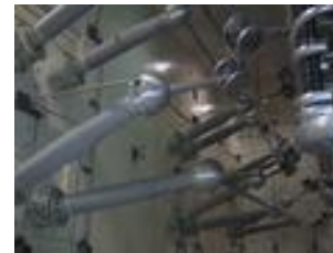
Southern Terminal of the \pm 500 kV, 3,100 MW Pacific HDVC Intertie

Sunday's Technical Tour will be to Sylmar HDVC Converter Station in Sylmar, CA. The tour will depart Costa Mesa at 7:30 AM and return at 1:30 PM.